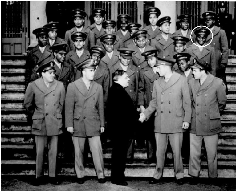
Members of the Nation's first Negro Navigation Cadets, who received their commissions into the Army Air Forces on February 26th, 1944. They visited New York City as guests of Mayor Fiorello H. LaGuardia. They are shown here on the steps of City Hall.